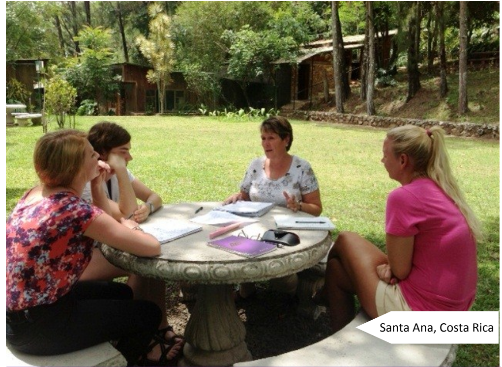
Santa Ana, Costa Rica