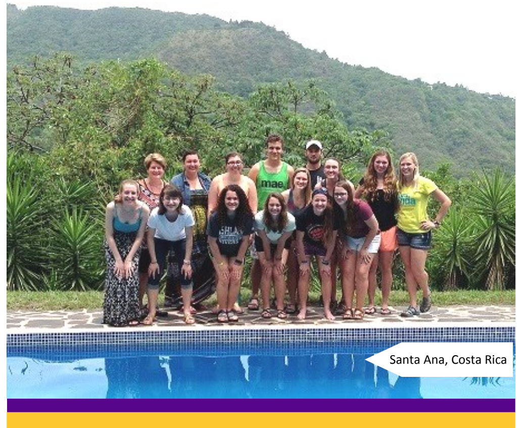
Santa Ana, Costa Rica