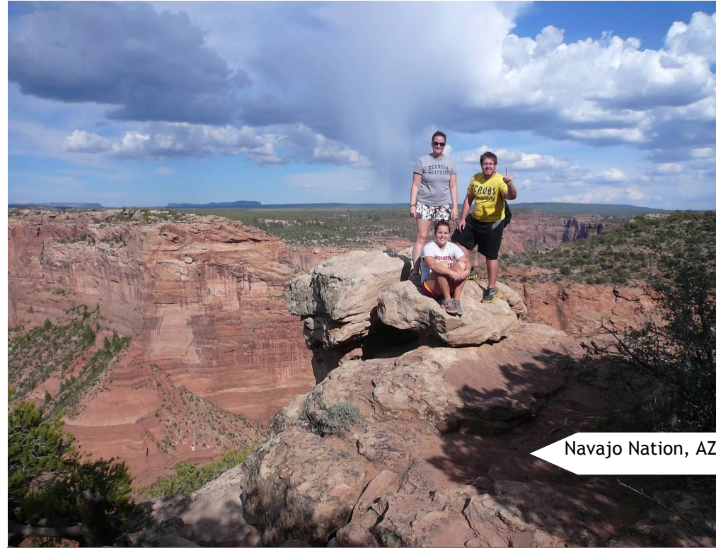
Navajo Nation, AZ